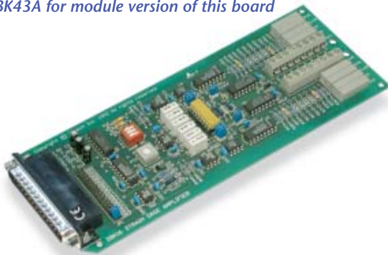
The DBK16 allows connection of most strain gage types to a data acquisition system

A 2-channel strain gage expansion card for IOtech's data acquisition systems, the DBK16™ is a general-purpose card that accommodates the connection of most strain gage types, from single-element quarter bridges to 4-element full bridges. The DBK16 also includes provisions for bridge completion resistors and provides four adjustments on each of its two channels. You can adjust excitation voltage, input gain, offset nulling, and output scaling. Up to eight DBK16 boards can be connected to one analog input channel. For applications of five or more channels, use the 8-channel DBK43A™ strain gage module.