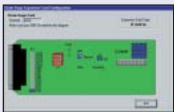
You can easily configure the DBK16 via its Windows® software

The DBK16 includes GageCal™, a program that enables you to easily configure, calibrate, and set up your pressure or load cell application. The program features an intuitive graphical user interface (GUI) that guides you through the configuration of the DBK16 and its adjustment to the applied strain gage bridge.