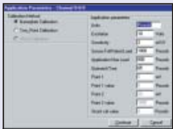
The DBK16's software supports three calibration methods: nameplate, 2-point, and shunt

Bridge Completion Resistors. Physical locations are provided for up to four user-supplied bridge-completion resistors per channel, allowing you to accommodate virtually any type of external configuration without having to attach bridge completion resistors at the strain gage.